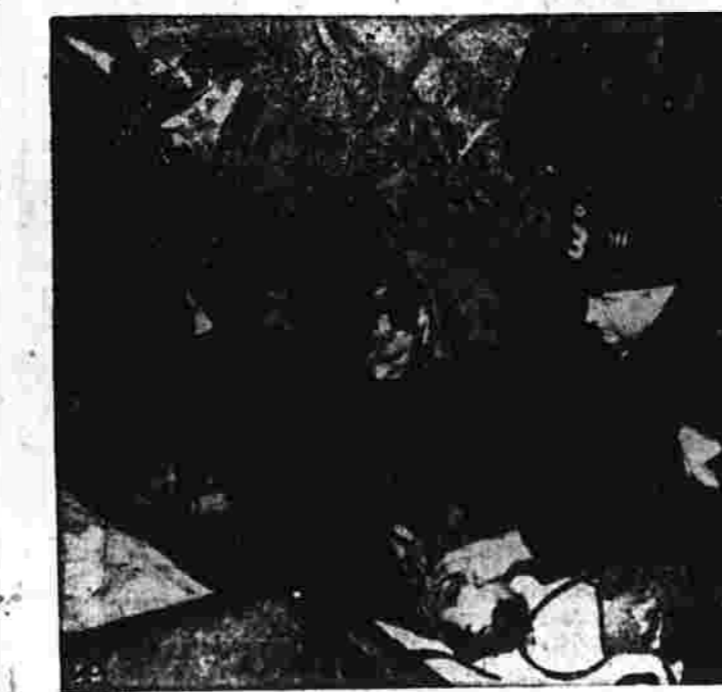
Use Pulmotor on Boat Crash Survivor

Syrian Army Seizes Country Holds New Leader, All Of Cabinet